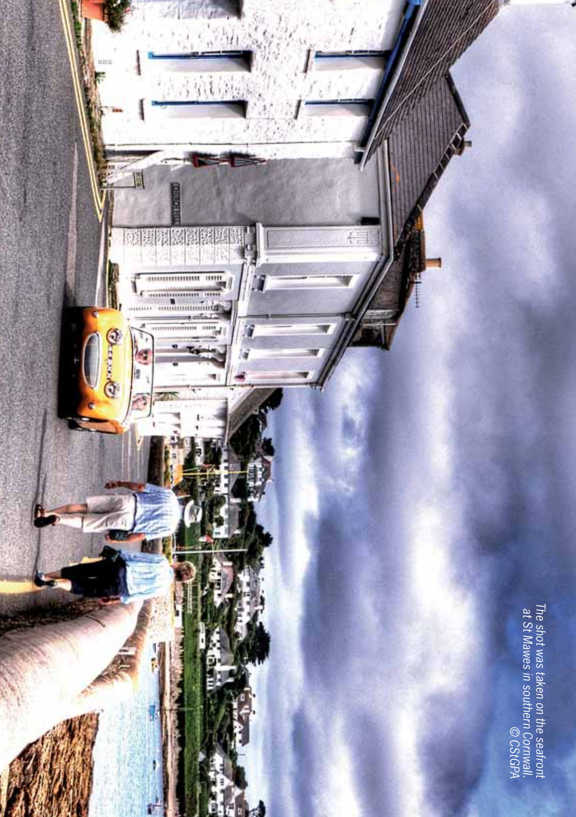
The shot was taken on the seafront at St Mawes in southern Cornwall.