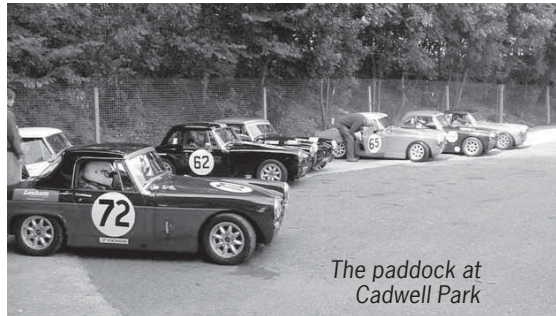
The paddock at Cadwell Park

Next it was off to the undulating Cadwell Park in Lincolnshire for a double header. David Weston. Dominic Mooney and Sharpe were the pole setters for race one. Weston. cleanly away from the grid, looked set for victory but pulled off on lap 8 – out of fuel. Yes David it is a longer than average circuit! Behind, Ethard Reeve, Sibley and Martin Morris jostled for position but the former two were also sidelined leaving Morris to secure the