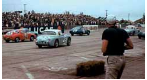
The No.55 Sprite following the No.53 Sprite at the start of the race

They exchange known histories, letters and documents which they have both gathered over the years. He then sells it to my neighbour who has plans of restoring and racing it again, but other projects get in the way. Along I come ... I have watched this car run it's races in California from early 1959, as my boss ran in the same race group and I worked on his car at about every race in