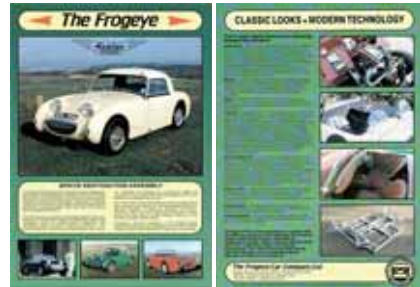
The original brochure

bonnet are inlaid with Kevlar panels to add strength, in fact one of Keith Brading's party pieces was to throw a blanket over the rear deck and stand on it!