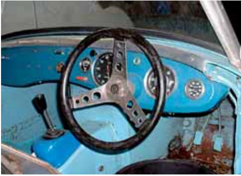
The interior before and after the rebuild