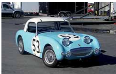
The Sprite at Laguna Seca

with wire wheels pictured behind the Lotus in the pits. I told him I was very interested in a copy of the picture and he emailed me one. It clearly shows a blue Sprite with wire wheels and the #53 in the same exact font and place as the "real Sebring car".