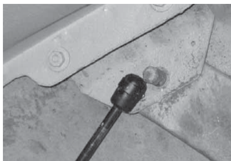
Top fixing point

There is one snag with the Passat struts in that they are 21 inches fully extended which limits the height of the opened bonnet. I have already priced a pair of 24 inch struts at my local breakers (fiver apiece mate he said and he has hundreds of them) which even for a parsimonious Spriter like me is do-able. I will have to make a couple of brackets and must remember to get a pair of threaded swivel balls off one the scrappers. £37 – Humbug!