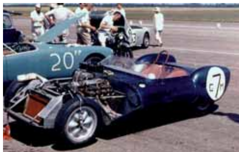
A Sprite with the number 53 (seen behind the Lotus) racing in the Midwest during the 1960s

Well I recently received a note from a guy who owns the Falcon Sprite from the 1960 Sebring race...he asked if my car had ever been in the Midwest for races in 1960. He has a picture that was given to him by the then owner of a Lotus Eleven that he now owns showing a blue Right Hand Drive Sprite #53