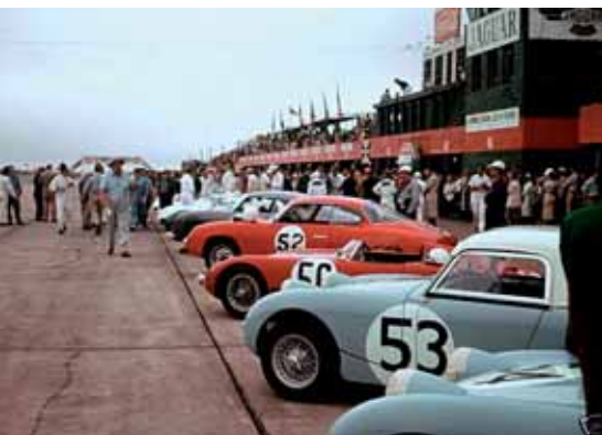
Sprites no.53 and No.54 line up at the start of the 1959 Sebring race