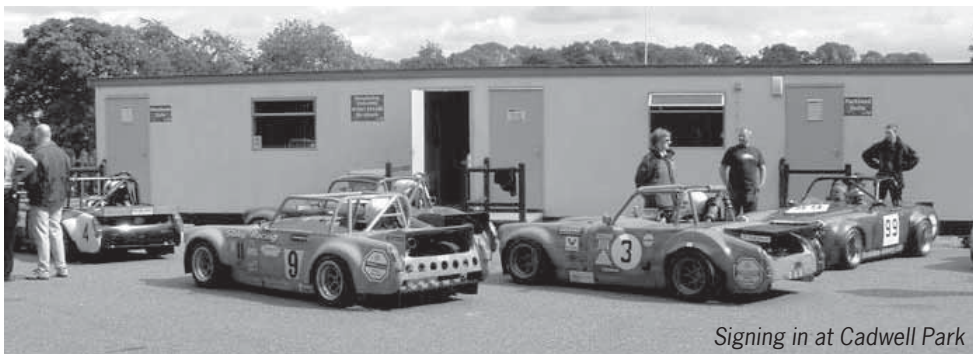
Signing in at Cadwell Park

Turner was the early Group B leader, but second placed Mooney was in a determined mood. 11 seconds down on lap 5 he steadily