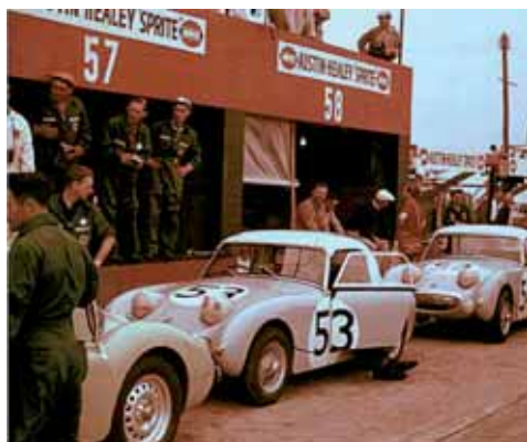
The No. 53 and No.54 cars in the pits at Sebring