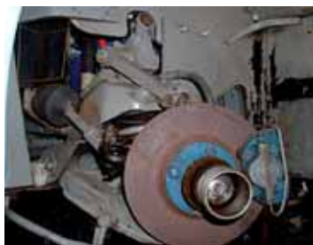
The rear brakes before and after the rebuild

The original Dunlop Light-car Disc brakes have been rebuilt and are installed on the car but the wire wheels are a new replacements (although Butch still has the original Dunlop 60 spoke wire wheels).