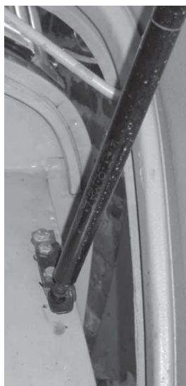
Foot of strut nearside

It was necessary to drill two ¼ inch holes next to the fixing lugs of the now redundant brackets to attach the threaded ball to the bonnet at either side. I then drilled two more holes each side approximately 2 inches down from the bulk head. The Passat struts have ready drilled swivelling "feet" attached to the bottom which take 11mm. (¼ inch) size bolts and it is a simple matter to bolt them to the bulkhead. I used a stiffener extending beneath each foot to spread the load because the bulkhead steel is of slender gauge though I am not sure it is really necessary.