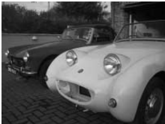
Bonnet painted and awaiting the grill

PS This Frogeye was registered July 1958, Chassis No 1991.