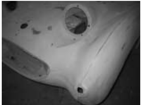
Bonnet in primer

Where I had effected the repairs on the front of the shroud I leaded loaded the area as I believed this would give a better result than