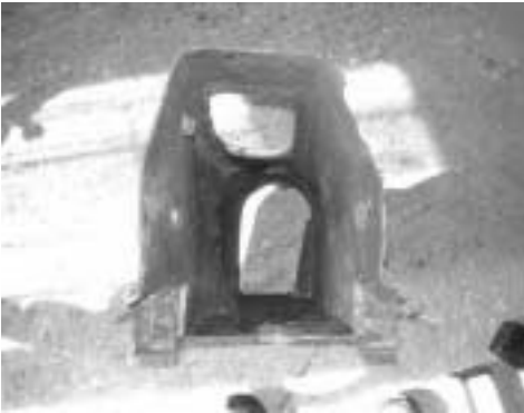
After removal of cross member

If using the Morris Minor (Birmingham) chassis strengthening plate then a 3/8in hole needs to be drilled in the chassis X-member 7/8in (and central) from the transmission tunnel on each side. The hole needs to be square to the chassis member and pass