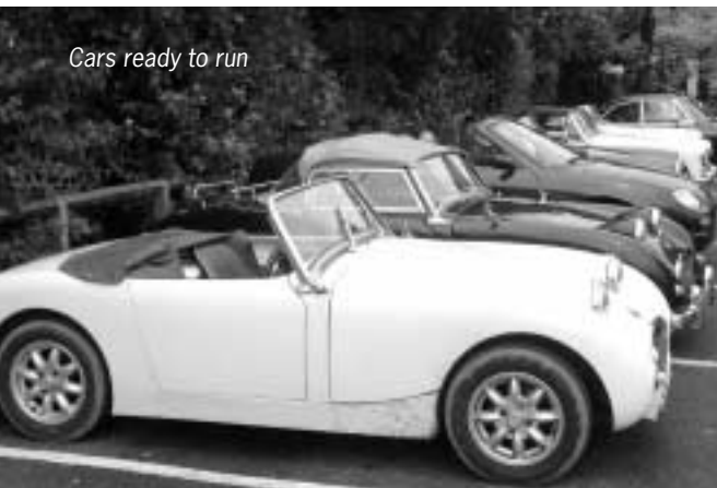
Cars ready to run