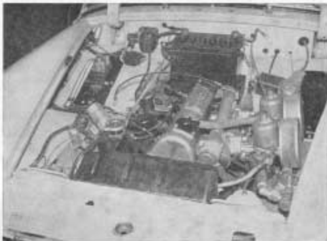
The Climax engine fills the available space on the Midget.

If flexibility is one aspect of the Coventry Climax engine, an appetite for high revolutions is an even more pronounced characteristic. When hurrying, one normally changes up at 6,000 r.p.m. and at this speed the short-stroke unit is completely unstrained. Modern "cooking" engines, with their pushrods and rockers, can be developed to give an astonishing performance, but for turbine-like smoothness at high revolutions the "camshaft job" has it every time.