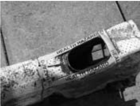
Cut out within tape for gear lever

through the closing tubes. The method that I employ is to drill through the top of the X-member and 'spot' the closing tube beneath. Using a rod through the jacking point the closing tube is knocked out of the X member. Using a bench drill the 'spot' is turned into a 3/8in hole. Mark and drill through the underside of the of the closing tube. Re insert the closing tube into the chassis X-member and align the holes. Drill 3/8in hole all the way through the chassis X-member. Drop a 3/8in bolt through and give a final dressing to the chassis X-member where it was originally cut then apply seam sealer and paint.