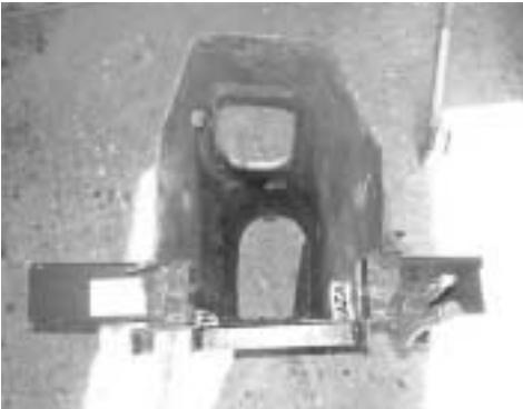
Closing panels and cross member 'dummed up'