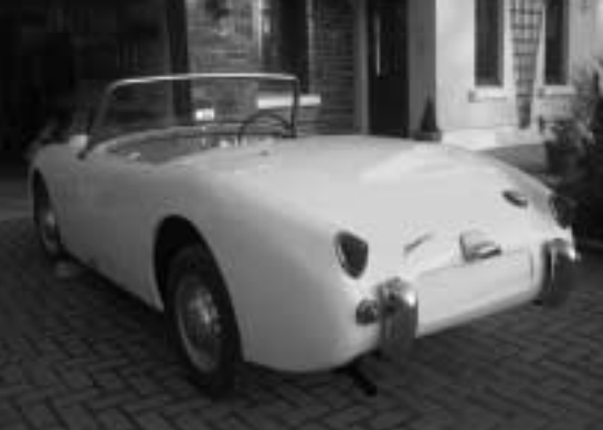
The whole car nearing completion

using filler. The radiator cowl was an awkward installation a well and I fabricated the strengthening panel that the bonnet handle attaches to.