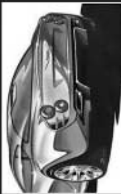
Sketch released last year by IRT Automotive gives clues to new Healey flagship.

Auto Express understands that three cars are being evaluated. First is a small front-wheel-drive Austin Healey coupé, possibly badged 'GTE' and based on the MG ZR platform. A second Austin Healey model, derived from the TF and with a mid-mounted V6, is also planned, while an open-top Healey coupé based loosely on the front-engine, rear-drive chassis of the MG ZT V8 is also mooted. However, using anything from MG's SV supercar programme is thought to have been discounted. That's because its design is in the hands of MG Sport and Racing, which is believed to still be owned by MG Rover's previous owner, Phoenix Venture Holdings.