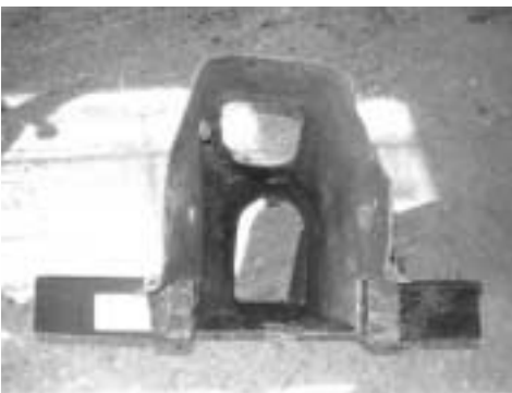
Closing panels in situ