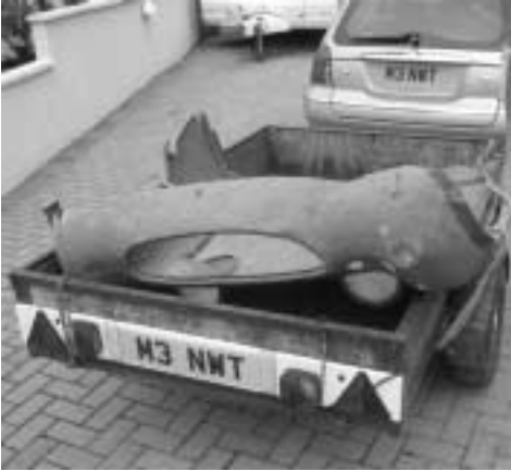
The bonnet brought back in the trailer

I thought you might be interested in hearing about how I recently restored the steel bonnet on my 1958 Frogeye. I would describe my skills at body restoration as competent but self learned from a number of restoration projects over the years on predominantly MGs. Whilst this Frogeye itself had received attention in the form of a very prolonged yet unfinished restoration by its previous owner, the bonnet had not been tackled and was in fact hanging upside down by rope in a car body workshop several miles away. The owner of the workshop had used this upturned bonnet as a shelf in which to store empty paint tins, car panels etc! Having got it down from the ceiling, together with a thick layer of dust, I put it in my trailer and