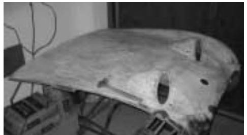
Bonnet minus wings and front valance

My next stage was to trial fit the T beading. This was a very awkward job as there is a tremendous curve in a Frogeye bonnet from