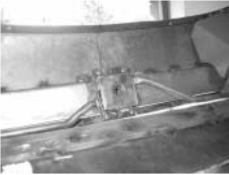
Bonnet handle mechanism arrangement

front to rear and so I had to place a number of cuts in the beading to enable me to bend it enough to follow the curvature of the wing. Once I was happy with it I clamped it into position with the trusty G clamps. I wouldn't like to say how many times I separated the wings, beading and shroud before I was satisfied with the fit but it was a very time consuming part of the job. This procedure of course had to be repeated for the other wing and the lower valance. At last everything seemed to fit together. At this point I decided I would have the central shroud sandblasted to clean off all the surface rust. This was a very nervous time for me as a sandblasting machine in the wrong hands can lead to all kinds of distortion and additional holes to resemble a colander! Thankfully the shroud survived although the middle part of the bonnet was not blasted as this was most likely to be distorted by the pressure. I cleaned this off with a wire brush on a 4" angle grinder.